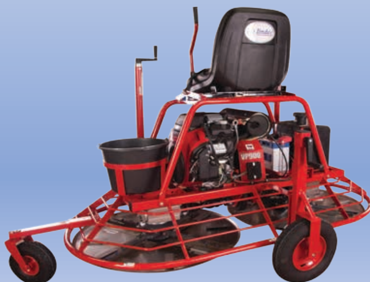
Picture shows machine with optional Dolly Wheels.

The machine is CE certified and follows all safety requirements of machine directives according to 2006/42/EG and AFS 2008:3.